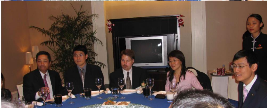
Some (international) participants and some presenters