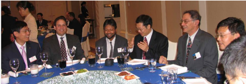
Lunch with PRC technical press